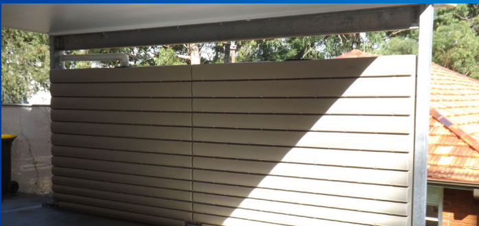
2 x 1000L tanks forming a screen for external carport.