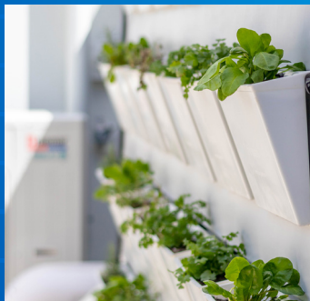
Plant wall feature