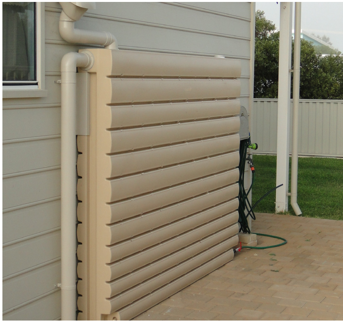
1 x 1000L tank against wall.